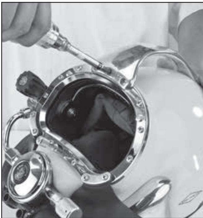
Use a torque screwdriver to tighten the front handle. See “Torque Specs” on page APNDX-19.

5) Torque the front mount screws. See “Torque Specs” on page APNDX-19.