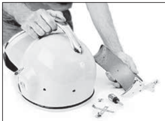
The rear weight provides the anchor point for the earphone retainers.

5) Be patient and take your time because the RTV is an excellent adhesive and makes removal of the weights difficult. If you are hasty you may damage the helmet shell.