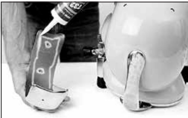
RTV (silicone sealant) is used to seal the weights to the helmet shell.