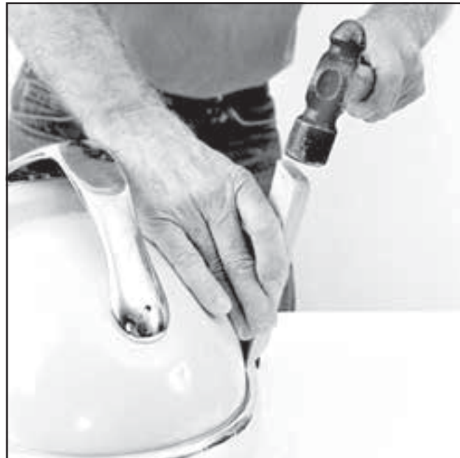
Use a wooden wedge to help pry the weight off the helmet.