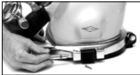
Fig. 6.11 - Remove the sealed pull pins.

3) Clean parts and remove any sand or grit. Clean out the slots where the pins enter the helmet ring. Ensure there is no grit or sand trapped inside that may interfere with the replacement of the pins.