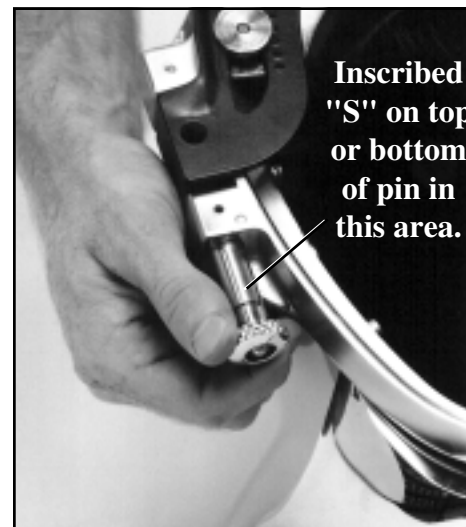
Sealed Pull Pin Assembly DSI # 505-110

Diving Systems International will replace the rubber O-rings with the new silicone O-rings free of charge for one year from the date of this notice. If you wish to have this done, please take the helmet to the nearest authorized DSI dealer. The dealer will change out the both of the pull pin assemblies and install replacement assemblies which use the silicone O-rings. If there is not a dealer nearby the user may remove the sealed pull pins (see this sheet for instructions) and send them to DSI. DSI will replace the rubber O-rings with silicone O-rings and return the pins to the user as quickly as possible.