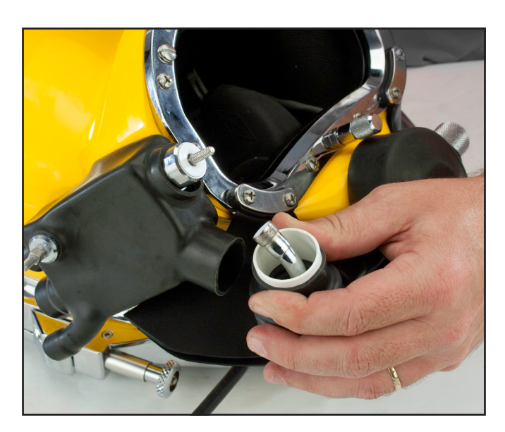
Install the corrugated tube.

10) Attach the side block end of the bent tube to the side block assembly. Using the torque wrench and <sup>11</sup>/<sub>16</sub> attachment, torque the bent tube, see "Torque Specs" on page APNDX-19 for correct torque. If the regulator end of the bent tube was