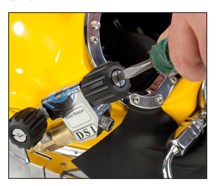
Remove the steady flow knob.

2) Remove the steady flow knob, locknut, and spring.