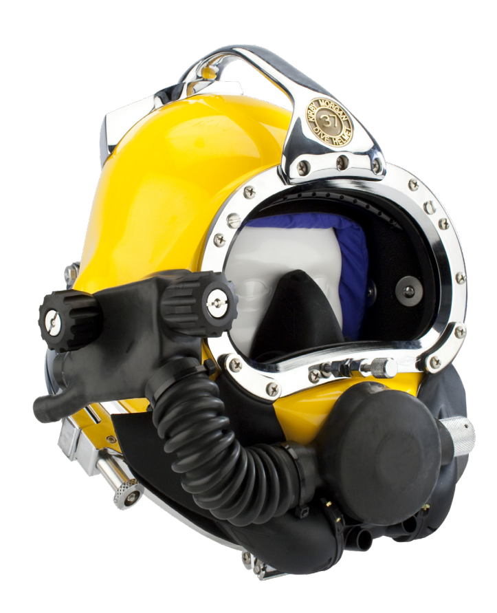
The hot water shroud is recommended for cold water and/or deep mixed gas diving.

The P/N 525-100 Hot Water Shroud Kit shown in this manual fits most KM model helmets and BandMasks<sup>®</sup>, but DOES NOT FIT the Stainless Steel models (KM 77, 37SS, KM 97) or the KM 47. For information regarding hot water shroud kits for these models, please contact your Kirby Morgan dealer or e-mail <u>sales@kirbymorgan.com</u>