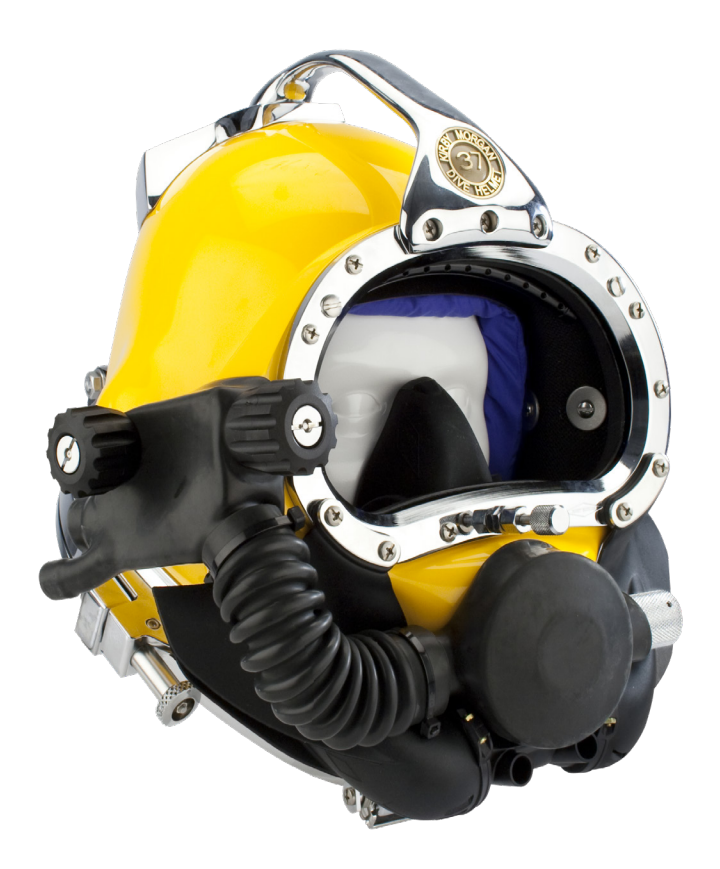
The completed installation.