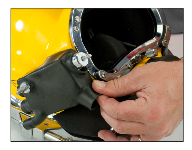
Position the shroud over the side block.

6) Install the rubber side block cover. Start by inserting the one way valve through the square hole on the back side of the cover. All the other holes will then line up correctly.