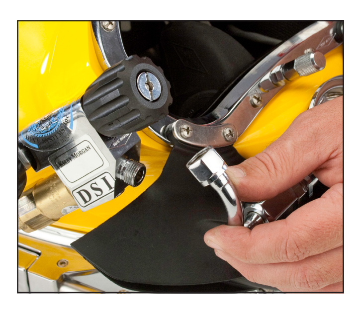
Loosen the bent tube.

2) Remove the steady flow knob, locknut, and spring.