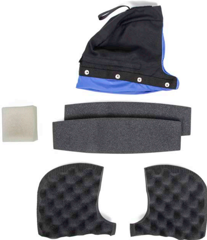
The components of the head cushion.

There are a number of ways to stuff the head cushion with foam. Different combinations of the provided foam can be set up and foam can be trimmed depending on desired fit. The below steps are intended to only aid and guide the user.