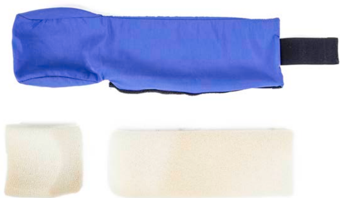
The components of the head cushion foam spacer (HCFS).