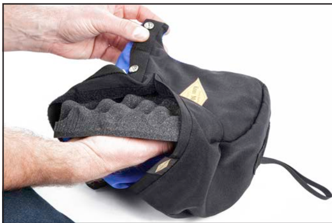
The “egg shell” side of the left and right side foams usually faces outward against the helmet shell.

TIP: First choose either the right or left side of the head cushion bag to begin stuffing the “egg shell” foam.