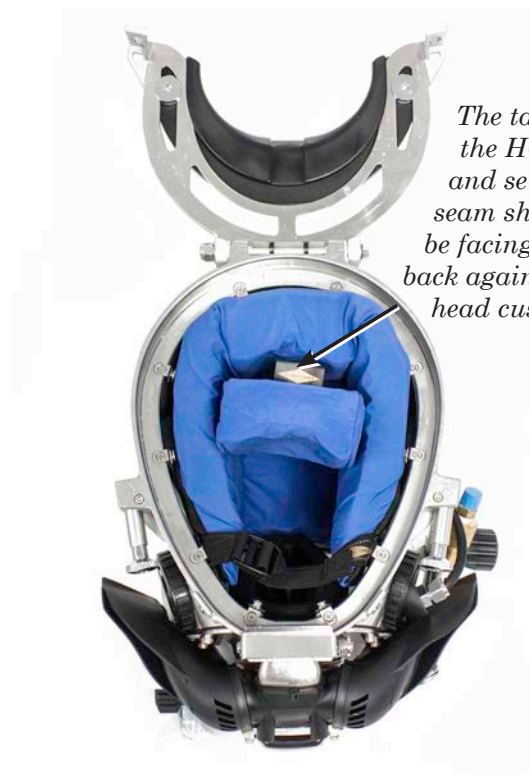
The tag on the HCFS and sewing seam should be facing the back against the head cushion.

1) Install the HCFS into the top inside portion of the head cushion. Wrap the elastic/Velcro® strap around the front top edge and attach onto the mating Velcro® patch in front of the hanging loop.