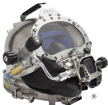
Kirby Morgan® 97