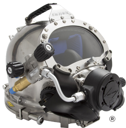
Kirby Morgan® 77

The bottom ring is an integral part of the stainless steel helmet shell (not a separate part as on fiberglass helmets)