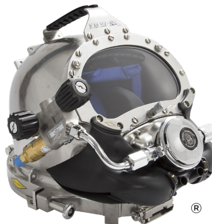
Kirby Morgan® 37SS