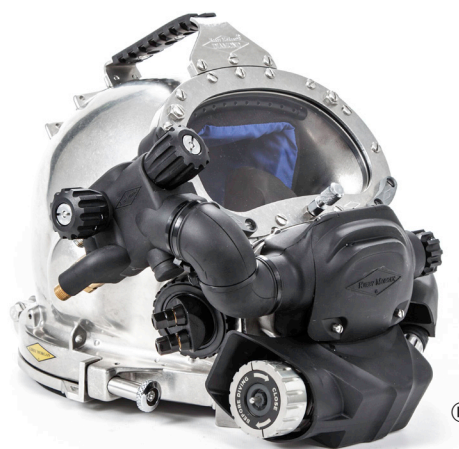
Kirby Morgan Diamond®

The Kirby Morgan 97 features a quick change communications module, available with either bare wire posts or a waterproof connector, and allows for easy, efficient maintenance of the helmet's communications. This same communications system is found in all our helmet models with the exception of the SL 17B and 17C.