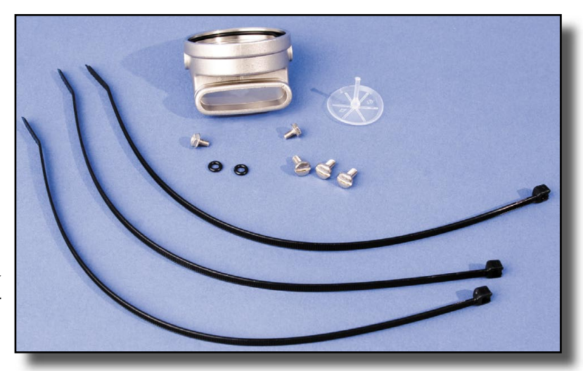
Components of the Quad Valve<sup>TM</sup> Cover kit.

The kit includes the quad exhaust cover that connects the exhaust whisker system to the helmet exhaust body, all required screws, tie wraps, and a replacement exhaust valve. Installation by a qualified KMDSI technician is recommended by Kirby Morgan<sup>®</sup>.