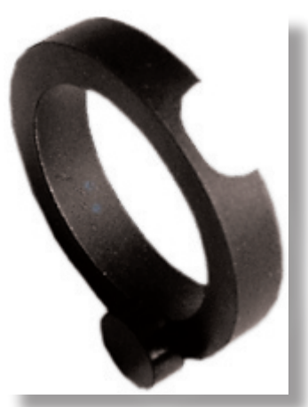
New Air Train Gasket

Note: This new product will <u>NOT</u> fit the KMB-28 Band Mask.