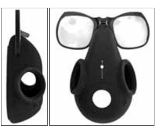
510-747 Oral Nasal

3. Next mount the Lens Retainer onto the Oral Nasal by insert the "legs" of the Mount Wire into the receiving holes located on top of the nose area of the Oral Nasal (510-747).