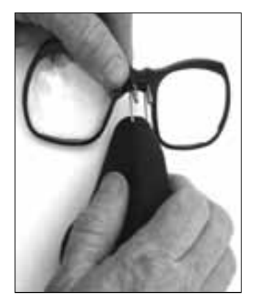
Put "legs" into the receiving holes of the oral nasal, P/N 510-747 and push all the way on.

Note: Make sure that the "legs" are oriented facing downward.