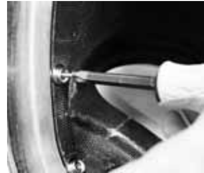
Fig: 1 A