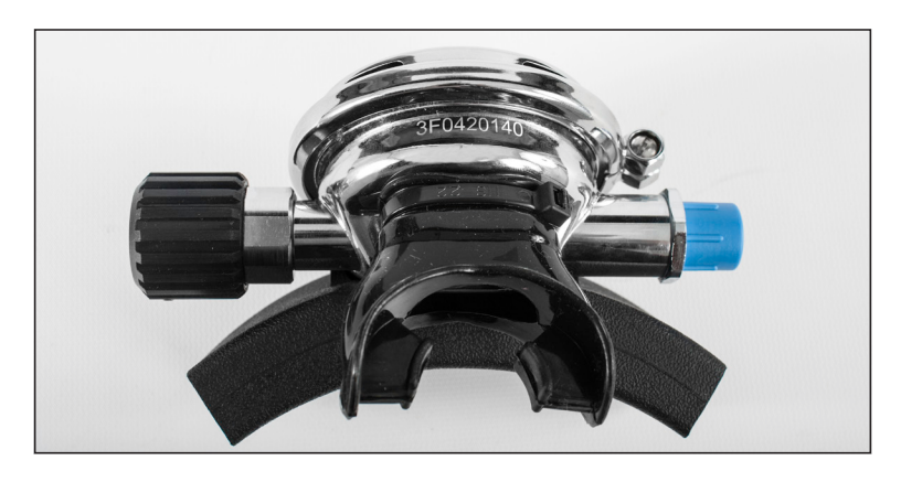
The 305-175 adjustable Metal SuperFlow® second stage regulator.

On both the 305-166 Adjustable and the 305-171 Non-Adjustable Plastic Second Stage regulators the serial number is printed on the top part, near the mouth piece. On the 305-175 Metal Adjustable (shown below) the serial number is laser etched on the top of the metal body.