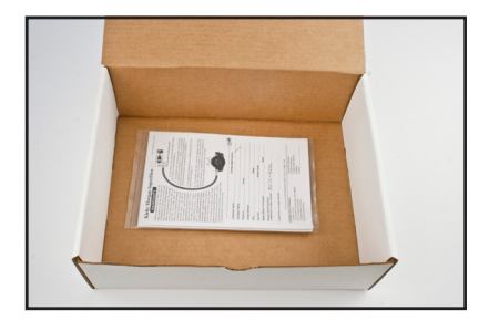
Packaging Step 2