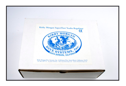
Packaging Step 5