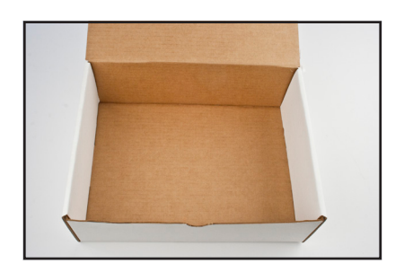
Packaging Step 1

The regulators are sent to dealers by plane and truck. Depending on how the dealer wants it sent.