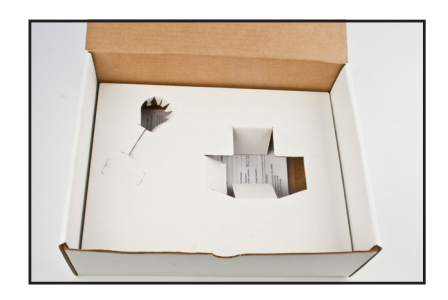
Packaging Step 3