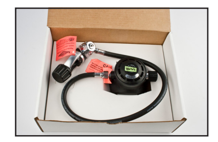
Packaging Step 4