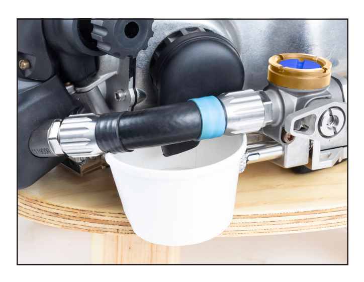
3) While maintaining a steady flow of gas through helmet, press and hold stem on exhaust assembly.