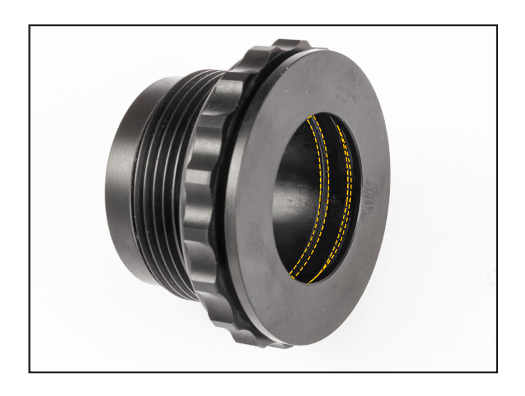
O-rings are set in grooves found closest to the knurled end on the main body.