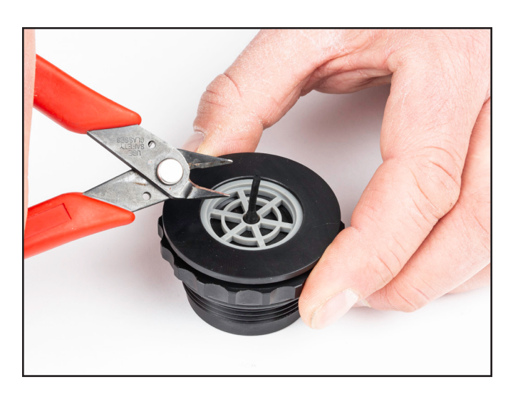
7) Lightly lubricate Compression Sleeve and insert into main body.

6) Trim excess material from valve stem.