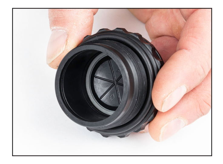
Extended rubber valve stem will face out from the main body. Ensure valve insert is pushed into main body past the two O-rings