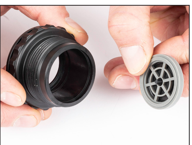
8) Remove old valve from Valve Seat Insert.