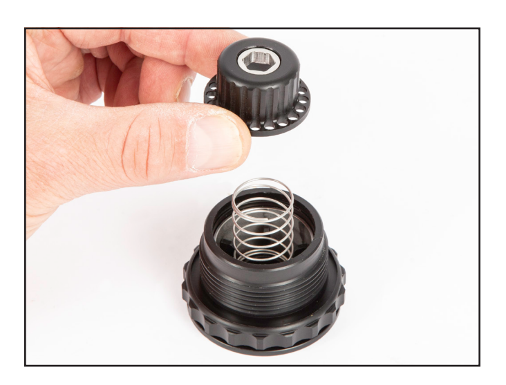
13) Insert Retaining Ring to complete installation.

12) Press Retaining Cap down into body until groove for Retaining Ring is visible.