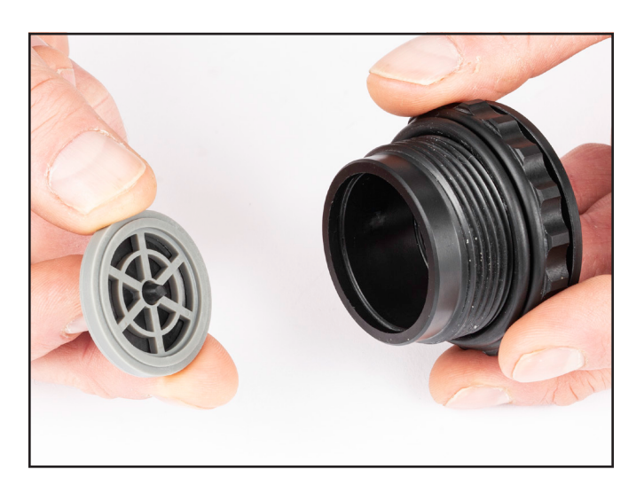
The valve will open into the main body.

5) Insert Valve Insert with valve installed into main body.