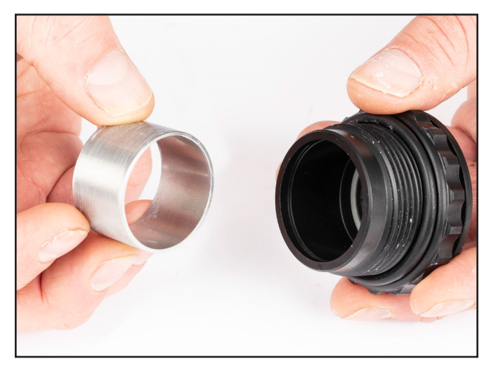
8) Place Retaining Cap into main body and push