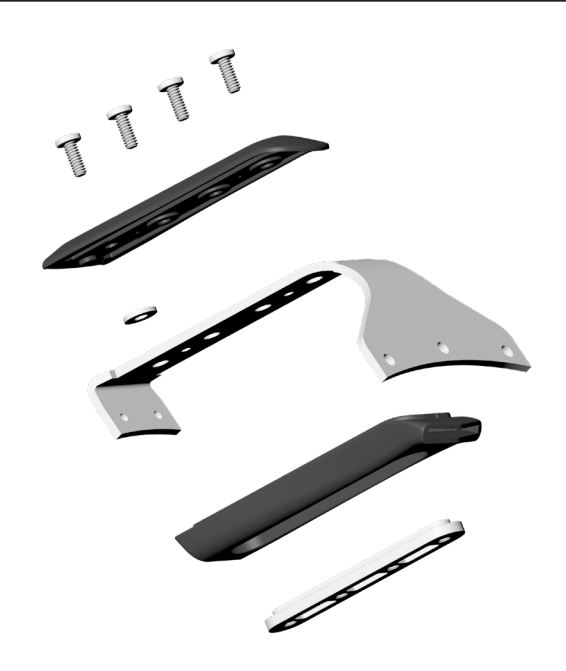
1) Remove the handle from the helmet. Refer to "1.1.1 Handle Removal On Stainless Steel Helmets" on page SSHNDL-1 of the "Handle on Stainless Steel Helmets" module.