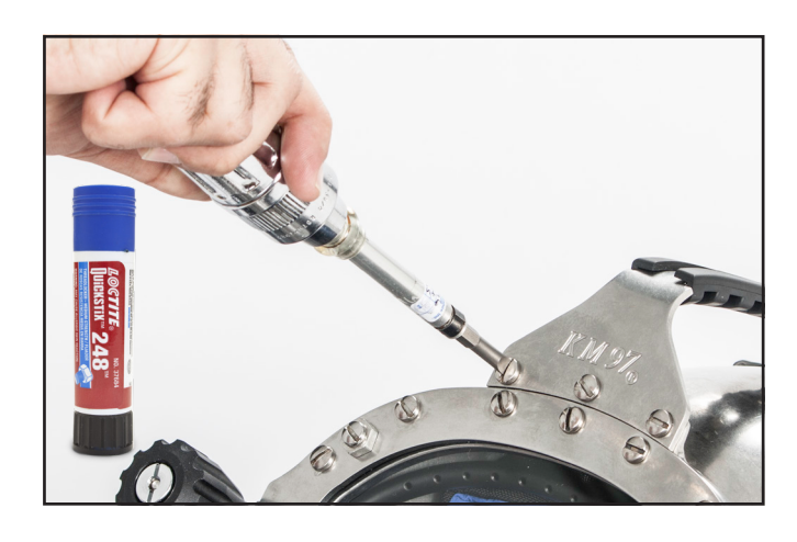
Tighten the screws on the front of the handle. See "Torque Specs" module.

5) Torque the front screws. See "Torque Specs" module.