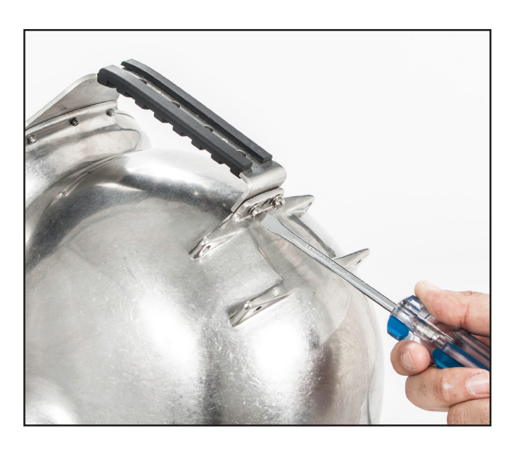
Remove the screws at the rear of the handle.

2) Remove the rear handle mount screws and washers. You can then remove the handle.