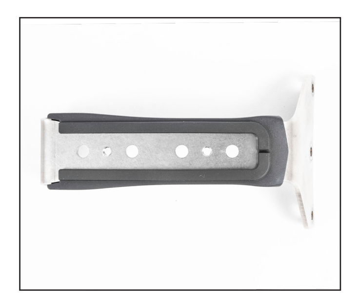
5) Turn the handle over and install the mount bar into the grip.