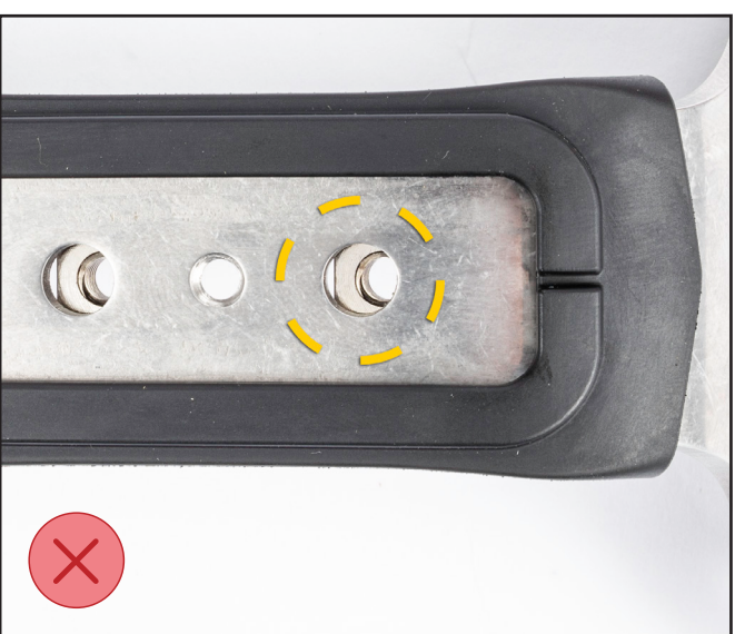
6) Turn the handle right side up and place the spacer washer aligned with the last hole on the handle.