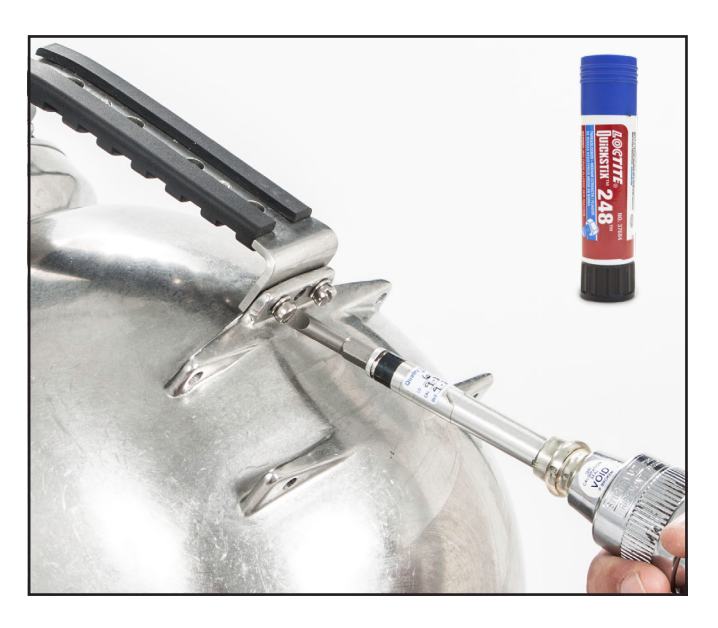
Tighten the screws on the rear of the handle. See "Torque Specs" module.

5) Torque the front screws. See "Torque Specs" module.