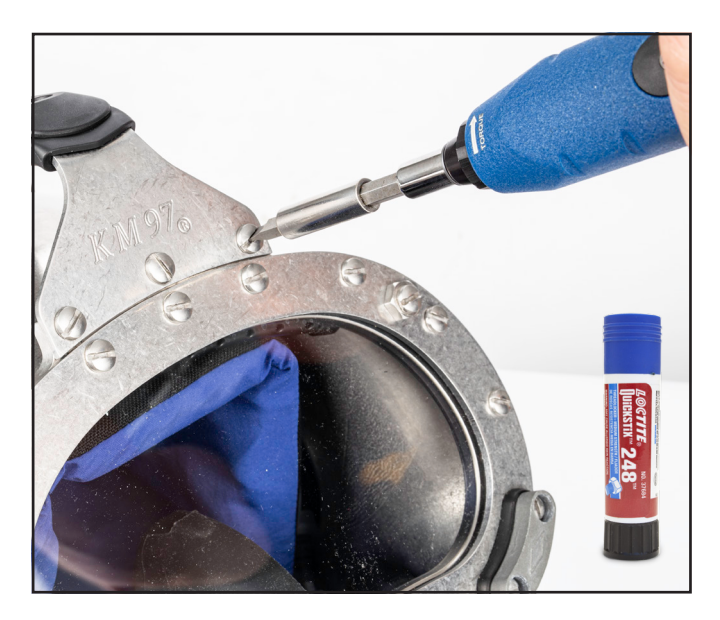
1.1.2.1 Camera and Light Bracket Mounting Options

There are two options for creating holes that can be used for mounting light and camera brackets to the handle: