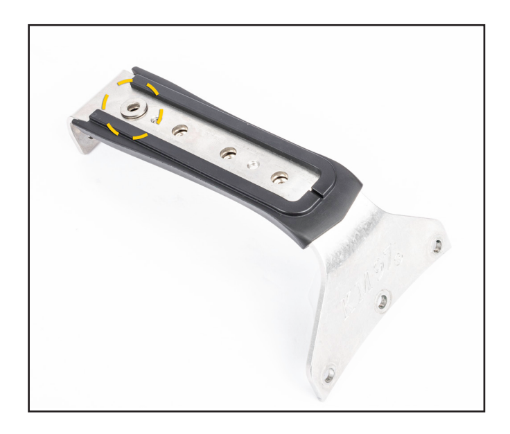
7) Install the top portion of the handle grip, ensuring the spacer washer remains aligned with the last hole on the handle. (Ensure the top edges of the grip are fitted into the groove on the underside of the handle top).