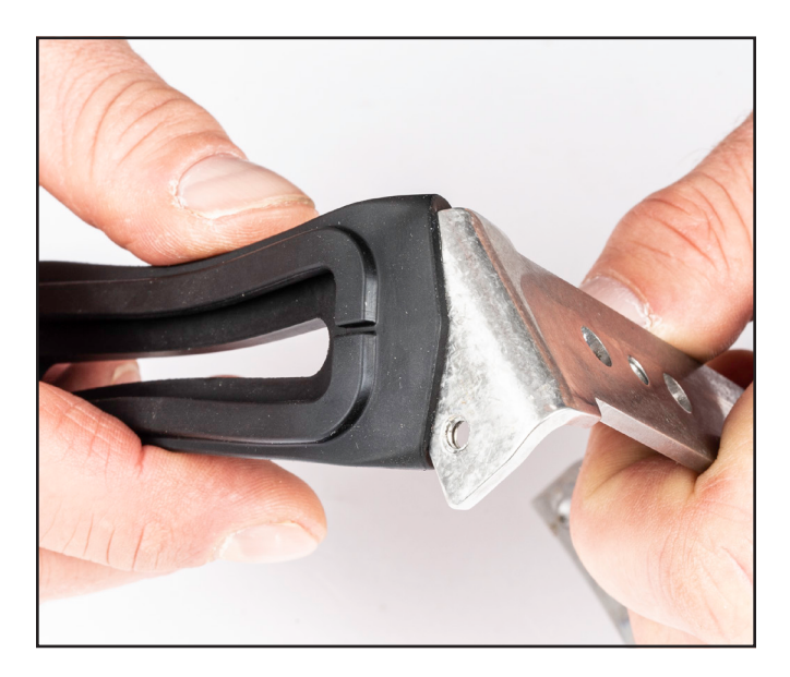
4) Slide the grip on until the front is aligned and seated in the "notches" at the back of the handle.