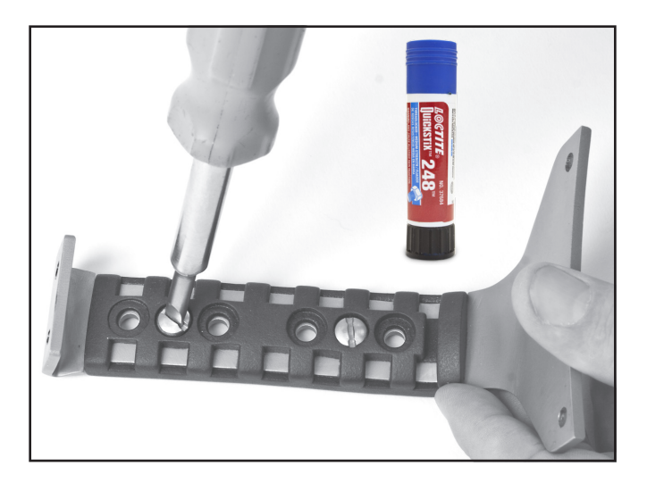
Tighten the screws to just until rubber begins to extrude. The tips will protrude slightly through the other side of the handle.