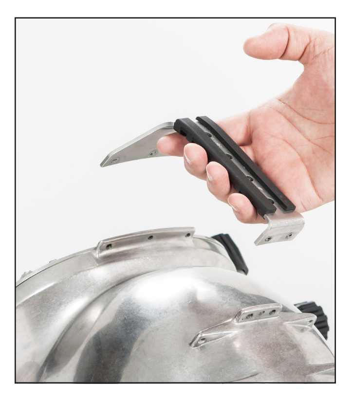
The handle can be replaced easily.