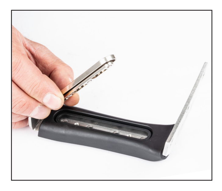
Ensure that the threaded holes on the mount bar are lined up with the holes on the handle.