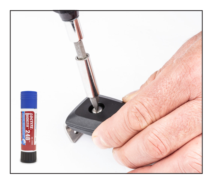
9) Reinstall the handle onto the helmet. Refer to "1.1.3 Handle Replacement On Stainless SteelHelmets" onpageSSHNDL-6ofthe "Handleon Stainless Steel Helmets" module.