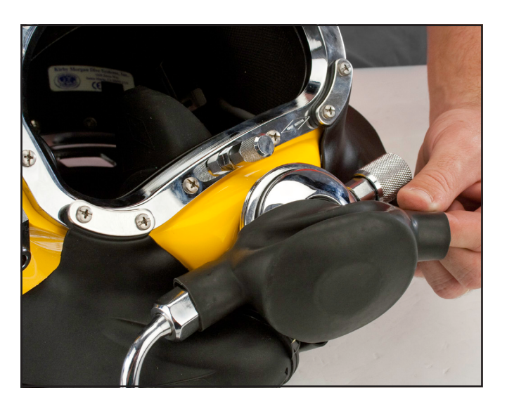
Pull the shroud over the regulator.

6) Install the rubber side block cover. Start by inserting the one way valve through the square hole on the back side of the cover. All the other holes will then line up correctly.