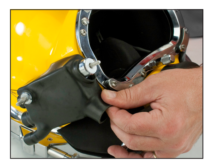
Position the shroud over the side block.

6) Install the rubber side block cover. Start by inserting the one way valve through the square hole on the back side of the cover. All the other holes will then line up correctly.