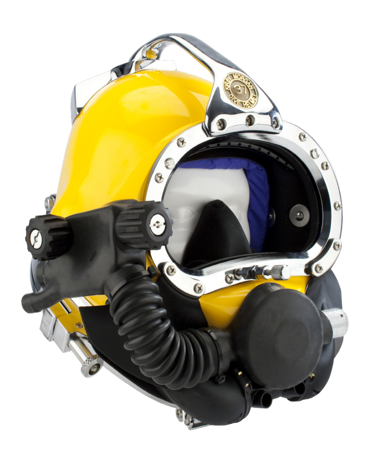
The hot water shroud is recommended for cold water and/or deep mixed gas diving.

The P/N 525-100 Hot Water Shroud Kit shown in this manual fits most KM model helmets and BandMasks®, but DOES NOT FIT the Stainless Steel models (KM 77, 37SS, KM 97) or the KM 47. For information regarding hot water shroud kits for these models, please contact your Kirby Morgan dealer or e-mail <u>sales@kirbymorgan.com</u>