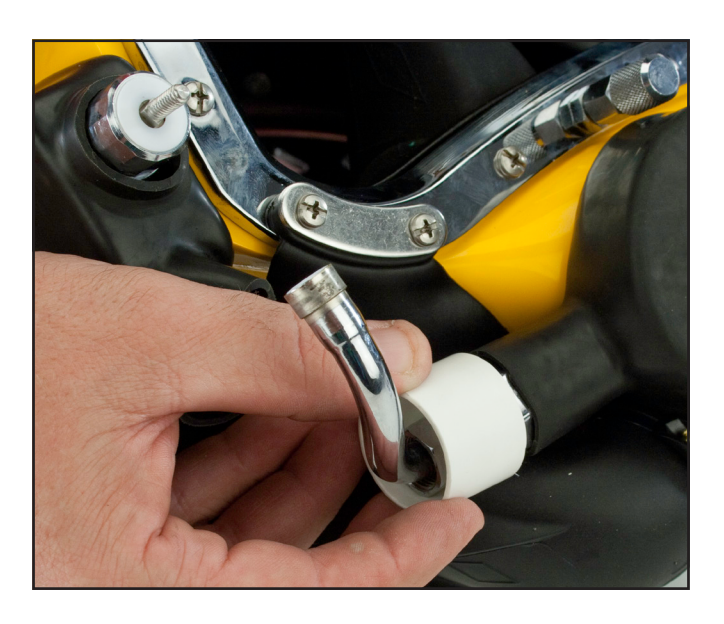
Slide one of the PVC pieces over the bent tube and insert it into the regulator shroud.