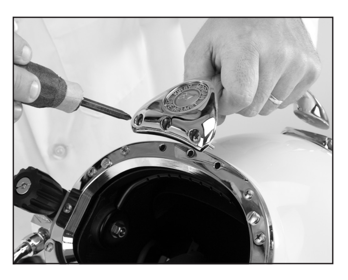
Position the handle on the helmet.

1) Position the handle and thread the front screws in only until snug.