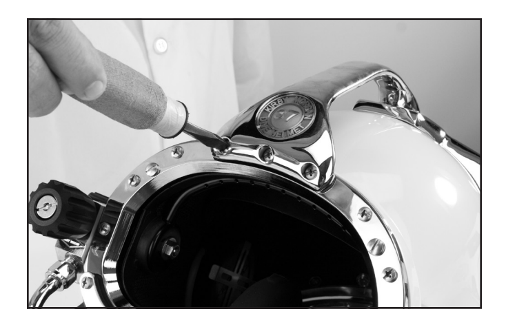
Unscrew\ the\ top\ three\ port\ retainer\ screws.

2) Remove the rear handle mount screw and washer.