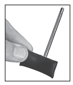
Install the nose block device through the interior of the oral nasal mask.

2) Slide the nose block shaft through the oral nasal insert and oral nasal mask then through the helmet and Nose Block Guide (on the Port Retainer).