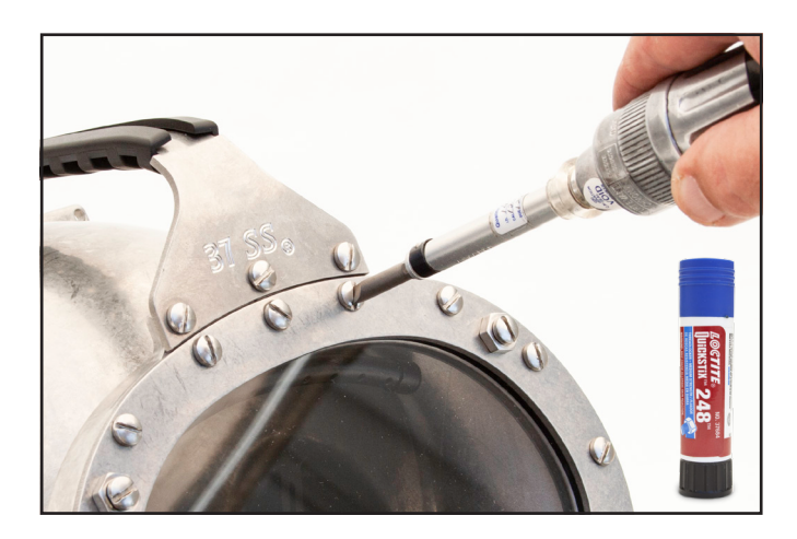
Always use a torque screwdriver to check the tension of the port retainer screws.

Always be sure to use a torque screwdriver to check the tension of the port retainer screws.