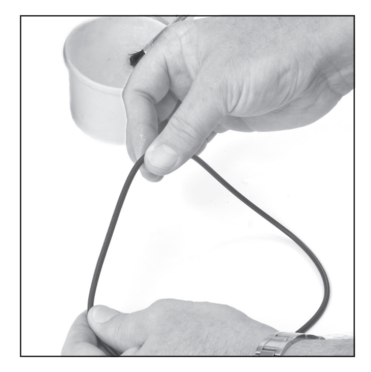
Lightly lubricate the port O-ring prior to installing it into the face port O-ring groove.

The O-ring used with the face port of the Kirby Morgan masks and helmets is made from a special compound and has unique dimensions. It is a softer durometer O-ring than is commonly available. There are no equivalent Orings manufactured by other vendors. This O-ring must be replaced with a new KMDSI O-ring. Failure to do so could lead to seal failure resulting in leaks or flooding.