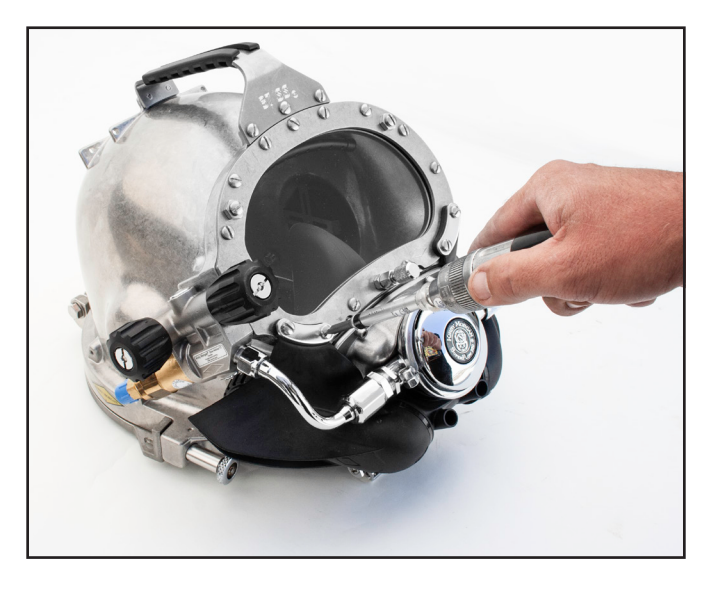
Remove the screws that secure the port retainer.

3) Next, unscrew the eleven port retainer screws and four whisker screws with kidney plates (or zinc anodes) and spacers. Pull the retainer clear of the helmet shell.