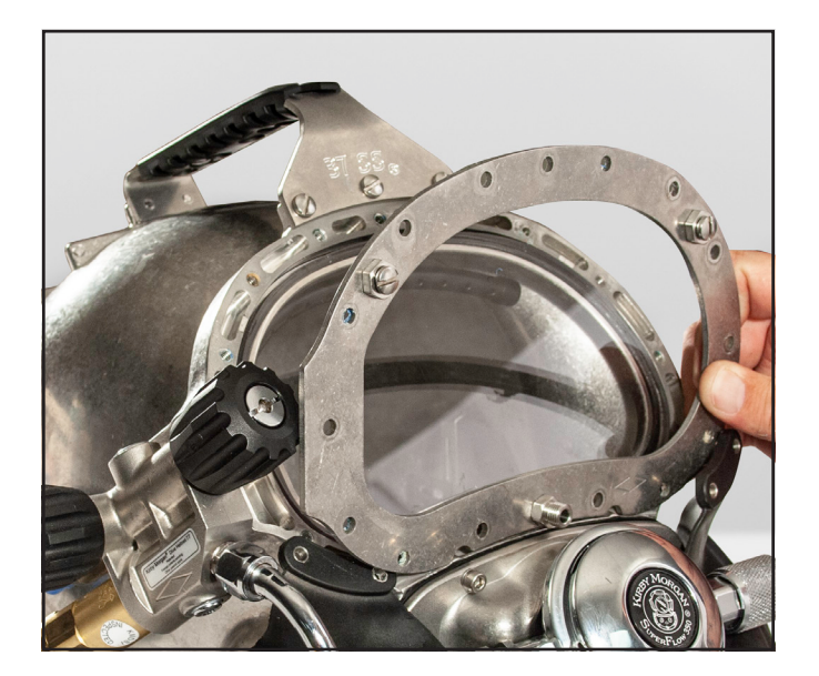
Remove the port retainer.

6) Remove the old face port and sealing O-ring.