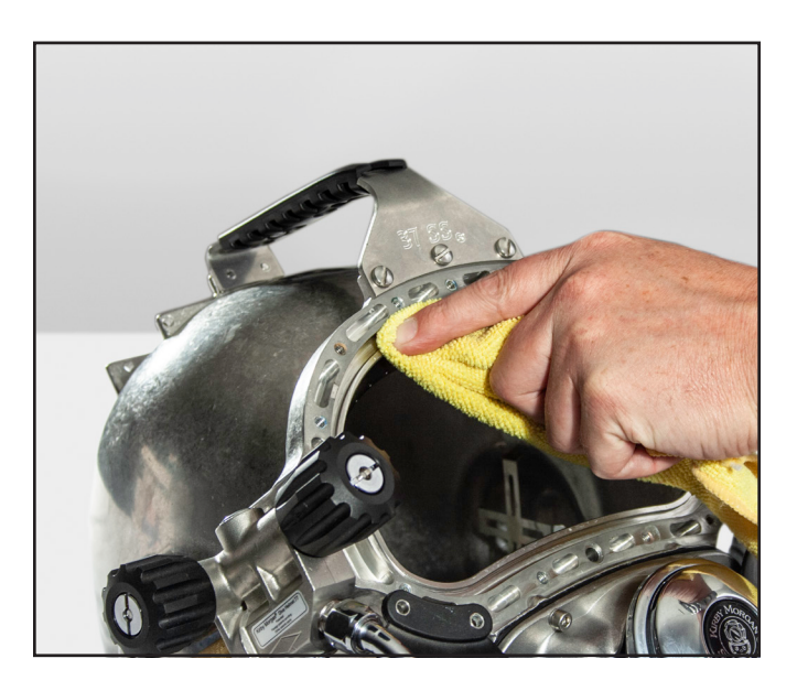
Clean the O-ring groove prior to replacing the face port O-ring.

1) Clean the face port O-ring groove, carefully inspecting it for any damage or foreign matter.