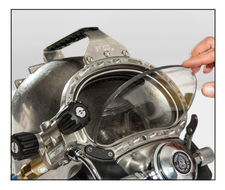
Remove the face port.