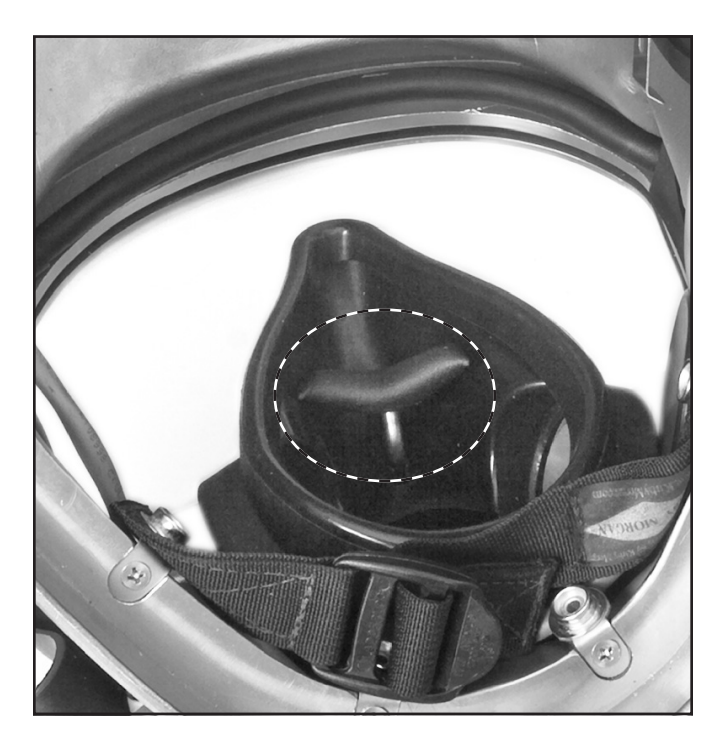
Properly installed nose block device.

5) Tighten the knob with the pliers, padded by a cloth, while holding the padded end with your hand.