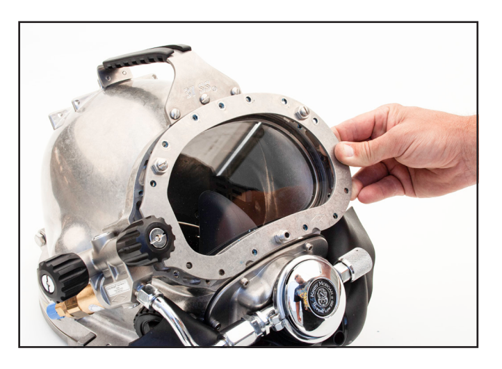
Place the port retainer on the helmet or mask shell.

6) Using a torque screwdriver slightly tighten each opposing screw evenly. Start at the center line of the helmet and work outwards in a circular pattern. Repeat this process, one after another, until all screws are evenly torqued. See "Torque Specs" module. After the process the O-ring should now be completely sealed the face port.