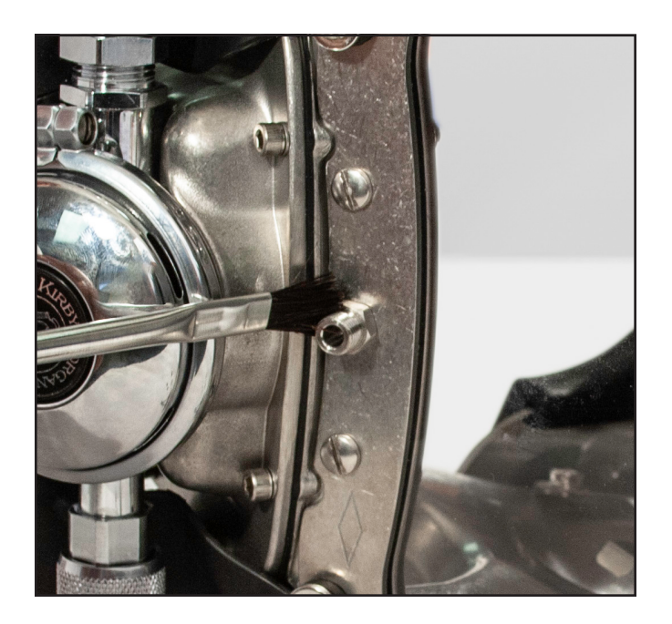
The threads of the nose block penetrator should be lubricated periodically. All of the parts of the nose block device (with the exception of the O-ring that seals on the back side of the port retainer) can be seen here.

2) Slide the nose block shaft through the oral nasal insert and oral nasal mask then through the helmet and Nose Block Guide (on the Port Retainer).