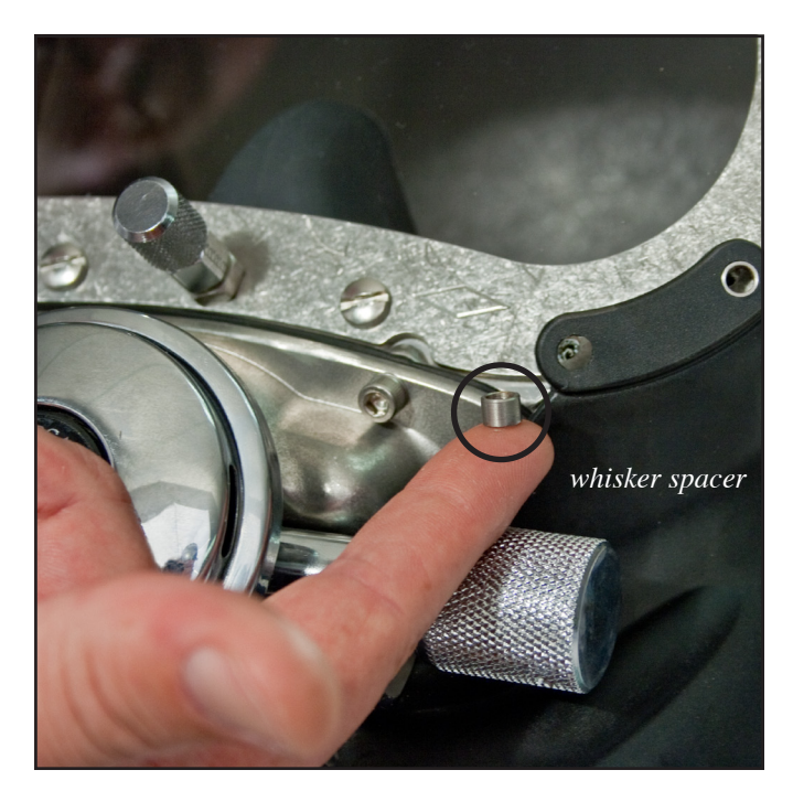
Do not misplace the whisker spacers.

6) Remove the old face port and sealing O-ring.