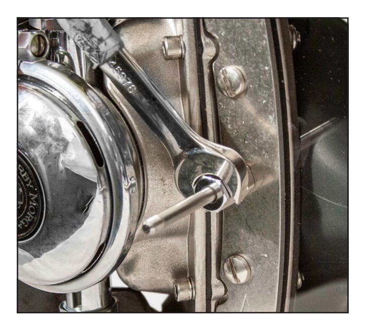
Do not tighten the nose block packing too much or the nose block device will not slide easily.

4) Tighten the packing nut until snug. Do not over tighten, as this will make it difficult to slide the nose block device in and out.