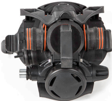
BAILOUT OPEN CIRCUIT

The main purpose of the open circuit Switchover Regulator is to give the diver the option of switching to an alternate off the loop gas supply. This is done without removing the Pod by simply rotating the Barrel Valve Handle to the vertical position. This will get the diver off the closed circuit breathing loop and immediately on to a known offboard open circuit gas.