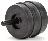
Tilt-to-Purge w/One Way Valve P/N 805-045