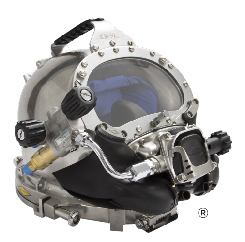
Kirby Morgan® 97 ( € approved

tions system is found in all our helmet models with the exception of the SL 17B and 17C.