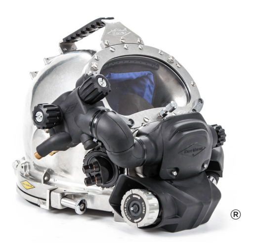
Kirby Morgan Diamond®

The Kirby Morgan 97 features a quick change communications module, available with either bare wire posts or a waterproof connector, and allows for easy, efficient maintenance of the helmet's communications. This same communications system is found in all our helmet models with the exception of the SL 17B and 17C.