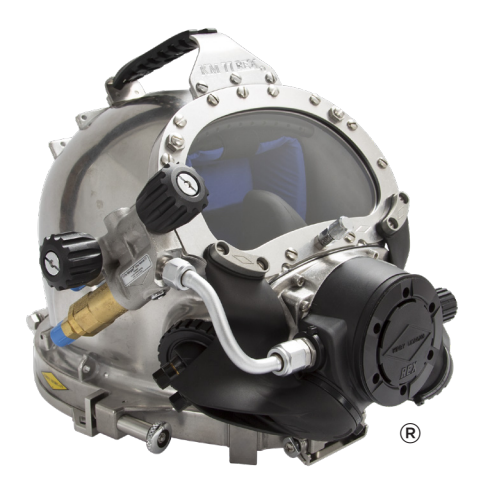
Kirby Morgan® 77

The bottom ring is an integral part of the stainless steel helmet shell (not a separate part as on fiberglass helmets).