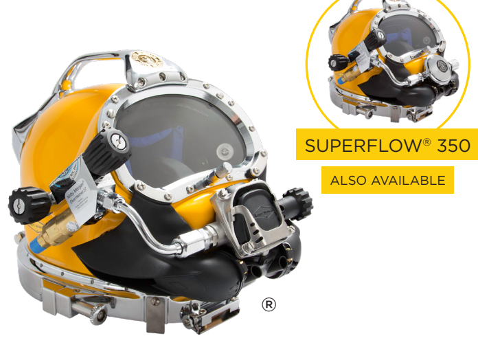
Kirby Morgan® 37

The other regulator choice for the SL 27® is the SuperFlow® 350, large tube, adjustable demand regulator. The helmet is available in the umbilical over the shoulder, "B" configuration only. The SL 27 comes standard with the exceptionally dry Tri-Valve exhaust system.