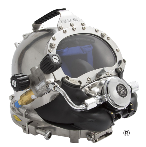
Kirby Morgan® 37SS