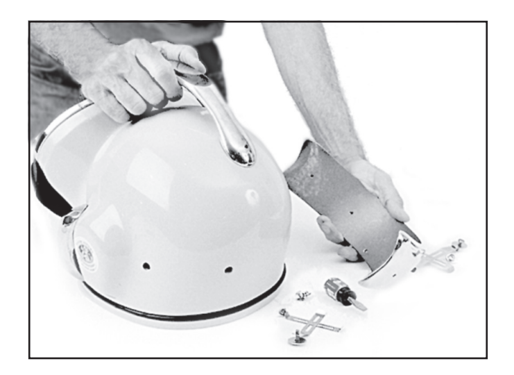
The rear weight provides the anchor point for the earphone retainers.