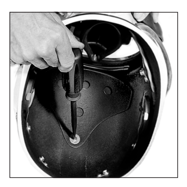
To remove the handle, you must also remove the internal screw.

3) Pry up at the front of the handle to break it loose from the RTV sealant.