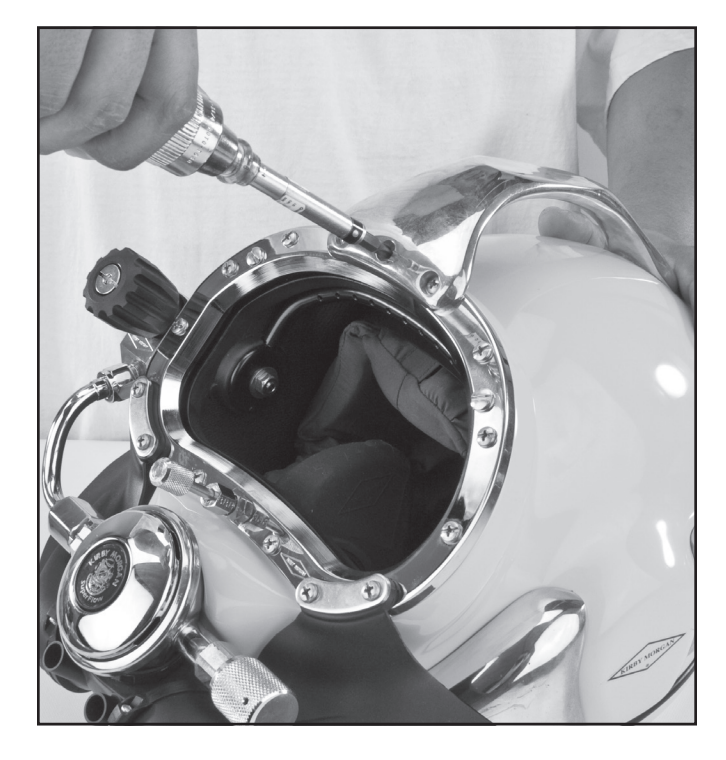
Use a torque screwdriver to tighten the front handle. See "Torque Specs" on page APNDX-19.