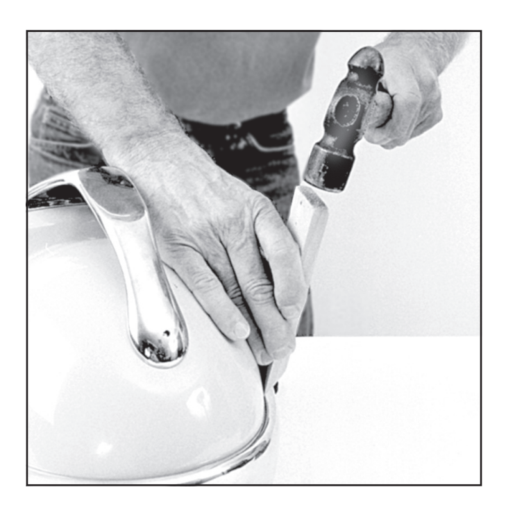
Use a wooden wedge to help pry the weight off the helmet.