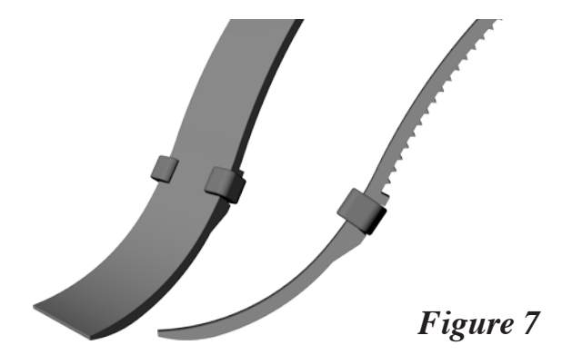
NOTE: Be certain to check fit of all the components on a regular Figure 6 basis, at the beginning of every dive and also after final cleanup. If these parts become loose, this may allow the buckle assembly to separate from the mask.