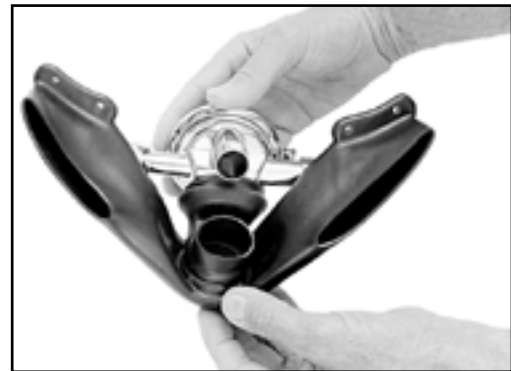
Mount whisker to regulator.

3) Stretch the new double exhaust kit whisker onto the regulator flange and install tie-wrap (2) loosely around whisker on the regulator flange. Place the regulator back into the nose hole of the helmet/mask frame. Stretch the double exhaust kit whisker over the special main exhaust body insuring the whisker is seated properly on the main exhaust body flange. Install tie-wrap (4) snugly around whisker on the exhaust body flange making sure that the tie wrap is in the slot on the exhaust body! This is very important to the sealing of the exhaust! Tighten the regulator flange tie-wrap snugly around the whisker, insuring that it does not become pinched between the helmet/mask frame & regulator. Cut off excess tie wrap ends.