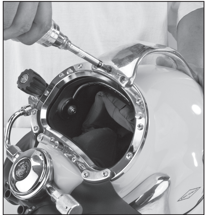
Use a torque screwdriver to tighten the front handle. See “Torque Specs” on page APNDX-19.

5) Torque the front mount screws. See “Torque Specs” on page APNDX-19.