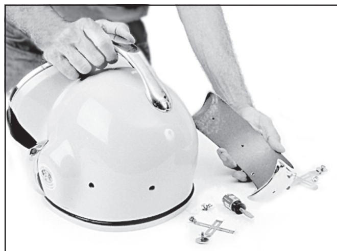
The rear weight provides the anchor point for the earphone retainers.

5) Be patient and take your time because the RTV is an excellent adhesive and makes removal of the weights difficult. If you are hasty you may damage the helmet shell.