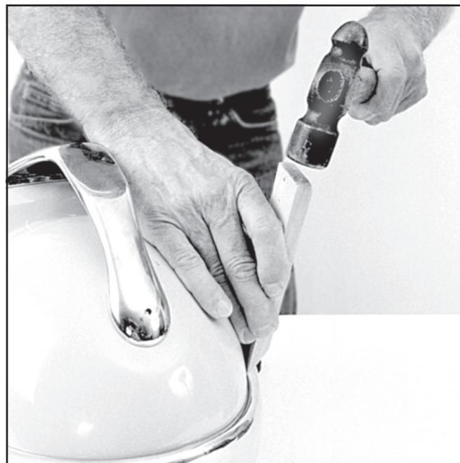
Use a wooden wedge to help pry the weight off the helmet.